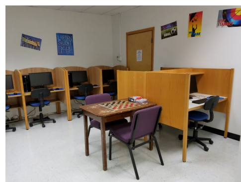
Americana Christmas @ the Library for Small Town Christmas, Glow-in-the-Dark Geometry Crazy 8's Math Club activity, and some of the Legacy Foundation grant computers.